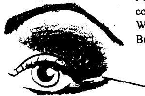
White Eye Pencil Here (in between liners)

Performance Browns shadow collection, Eye Liner Sealer, White Eye pencil, and Pro Brow kit.